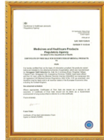
Free Sales Certificate