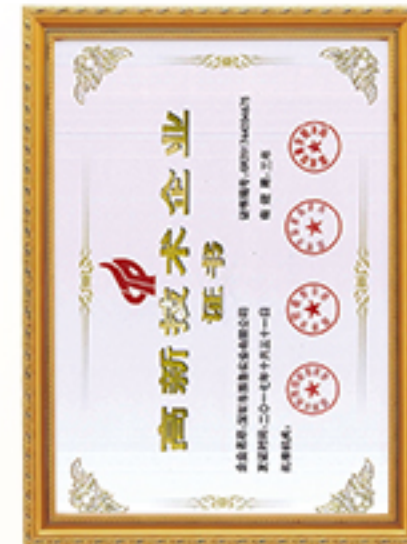
High-tech Enterprise Certificate